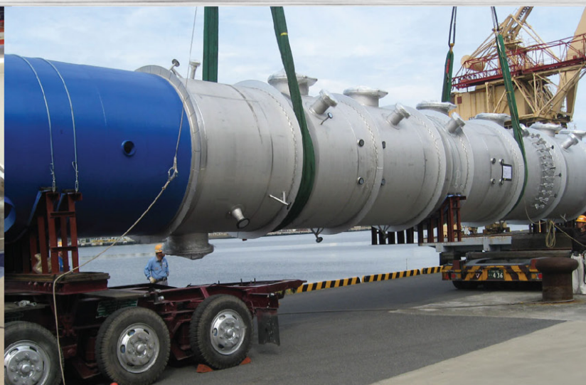
Process Column, Japan