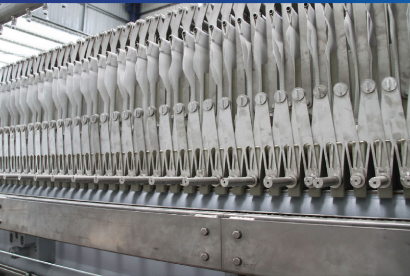
Oleic/Stearic Acid Filtration, China

As always, we are fully committed to providing the best possible support services, both locally and globally.