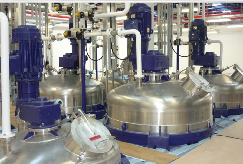
Process Mixing & Blending, Malaysia